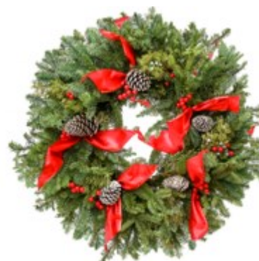
There are a variety of sizes. Pictures provided may not look like the ones shown.