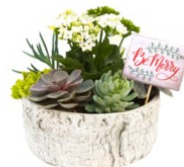
There are a variety of sizes & different pots. Pictures provided may not look like the ones shown.