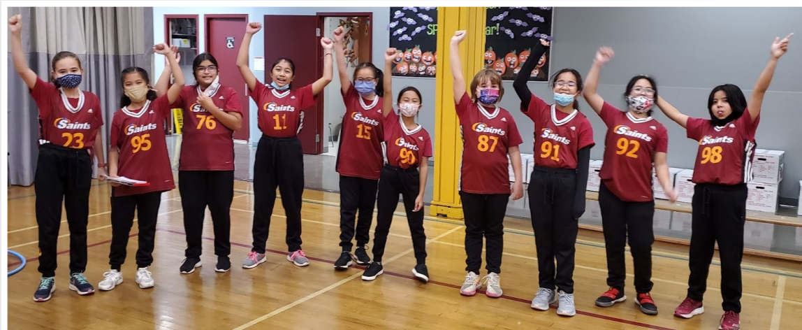
Grade 5 girls excited to get their jerseys and play with other schools!