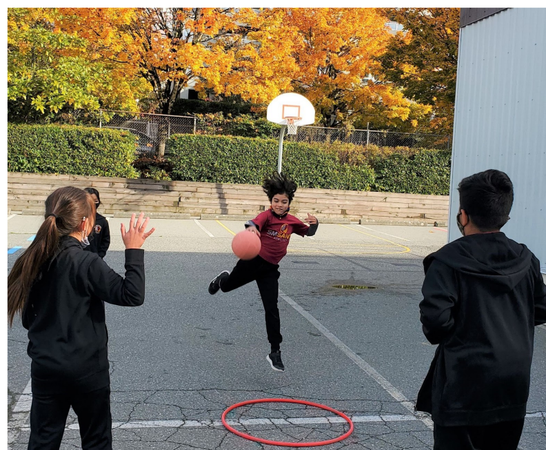
Grade 4 and 6 students playing Junior Spike Ball on a sunny fall day