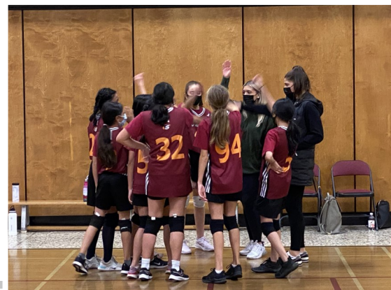
Grade 7 Girls volleyball team displaying enthusiasm and fair play at OLS!